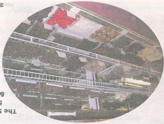
The Sugar Shack & Deli