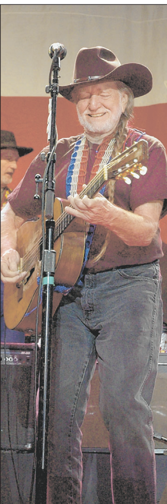
A smile on his face as he plays hit after hit to the roar of the crowd.